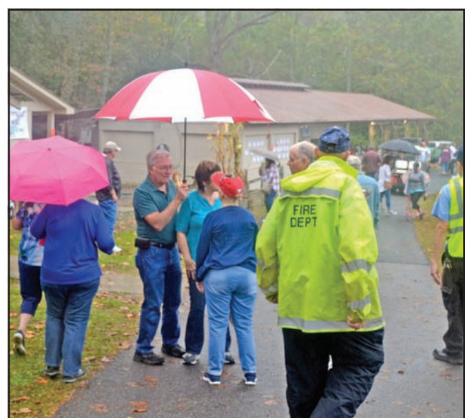
It rained some last year, but that didn't stop folks from attending the ever-popular Indian Summer Festival in Suches.

Tickets for the dance can be purchased for $5 on the field during the festival on Saturday, or they can be purchased at the door for $7, and children under 12 get in free.