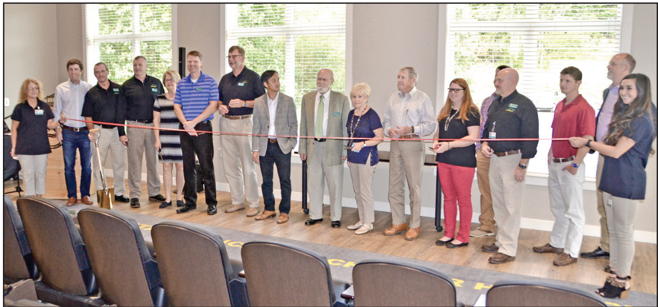
A special ribbon-cutting ceremony during the Grand Opening of the new MECHS Central Office in Cleveland on Saturday, Sept. 29.

The new facility will help MECHS to better implement its system goals and strategic plans, which in turn will further assist the many MECHS students in north Georgia with earning their high school diplomas.